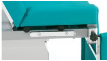
AV4088 -LATERAL UNIVERSAL PROFILES FOR ACCESSORIES LINK