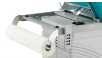
AV4097V -PAPER SHEET SUPPORT